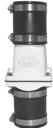
30-0021 Pvc Plastic

Consult Factory or local representative for state approvals