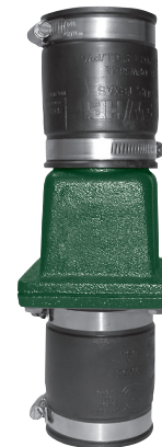
30-0151 Cast Iron